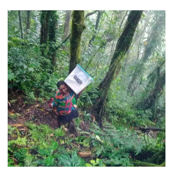
A heavy burden but bringing electoral access opportunity to remote communities in Vanuatu.