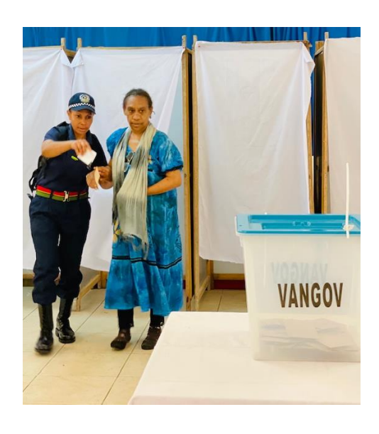
Vanuatu Police Force (VPF) officer assists a visually impaired voter to place her vote in the ballot box in recent Port Vila Municipal By-Elections. VEEP has recently supported a People With Disability (PWD) Action Plan to improve the access of PWD voters to electoral participation).